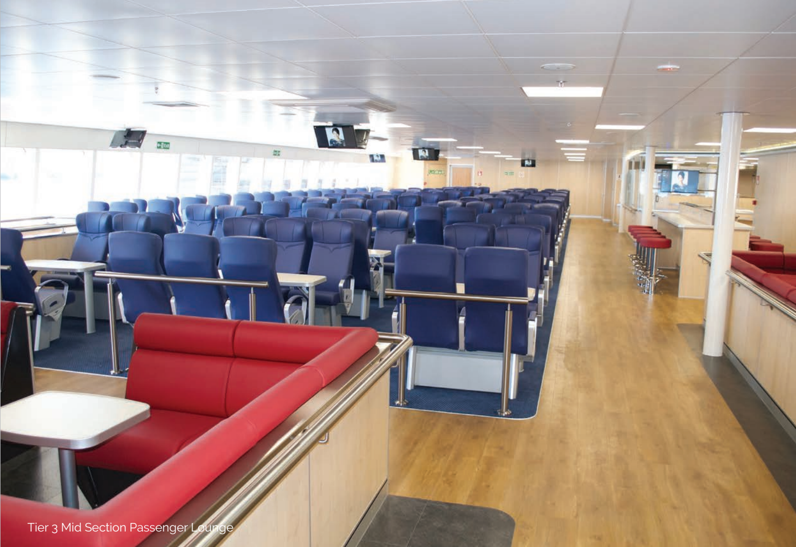
Tier 3 Mid Section Passenger Lounge