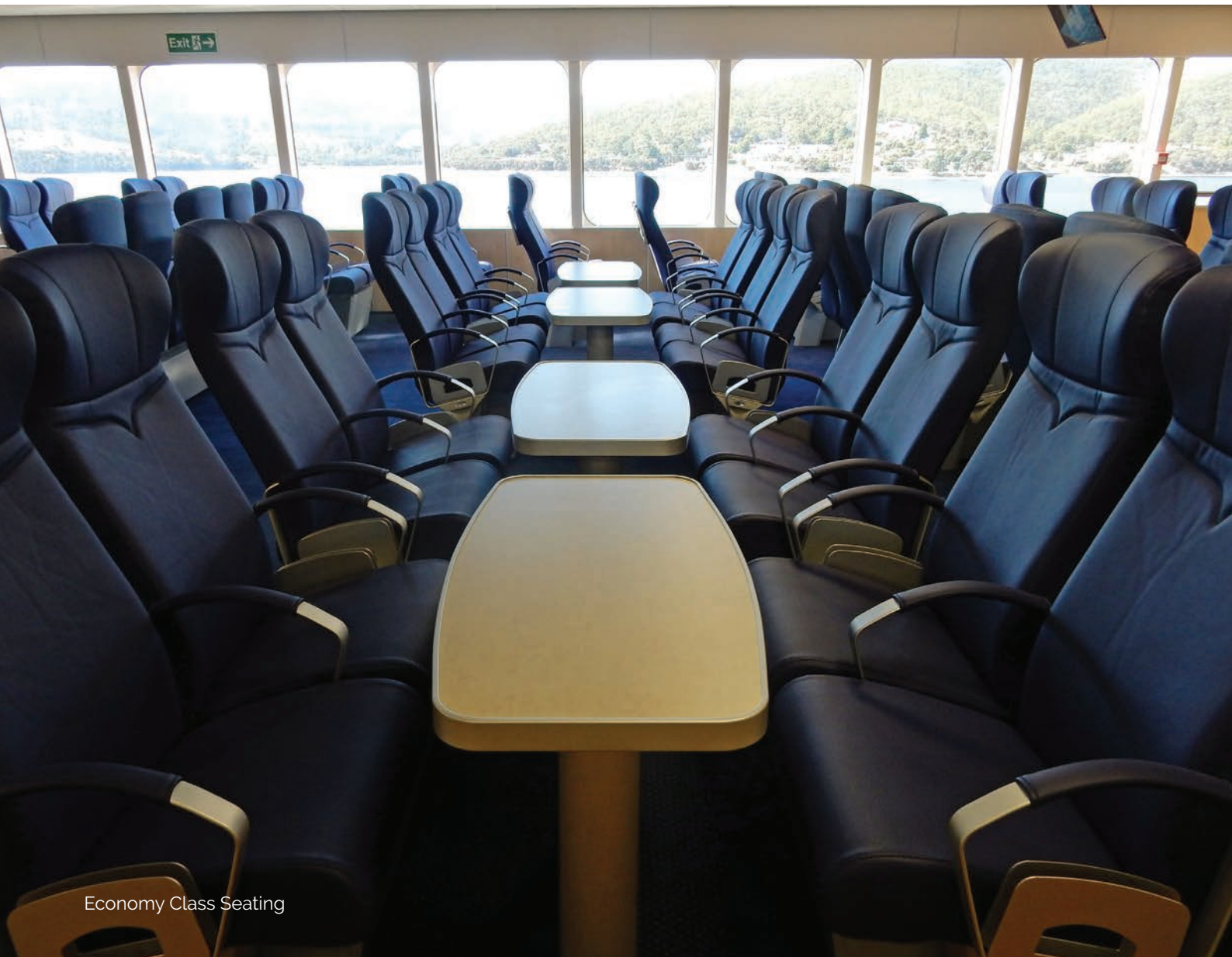
Economy Class Seating