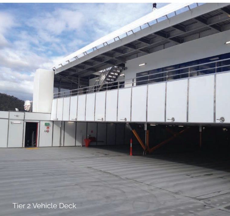
Tier 2 Vehicle Deck