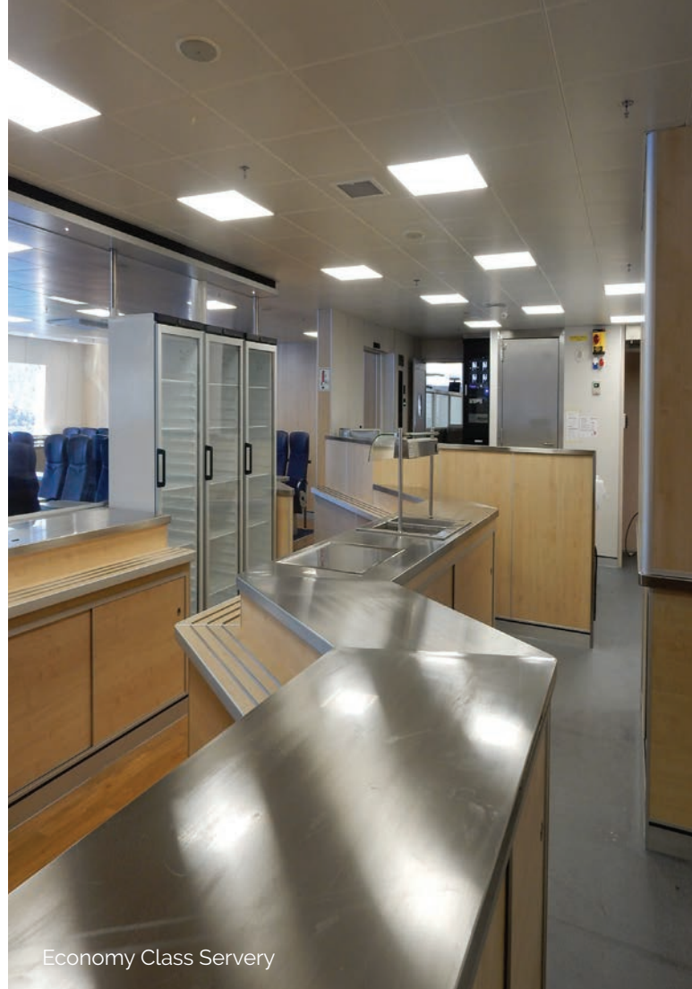
Economy Class Servery

When passengers walk to the aft end of the passenger area via the promenade deck, they are greeted by the calm tones of the grey upholstered passenger seating. There are plush navy carpets throughout the vessel. The walkways, featured throughout the vessel are clearly defined by tasteful hard wearing traditional oak vinyl flooring, with all wet areas finished in grey.