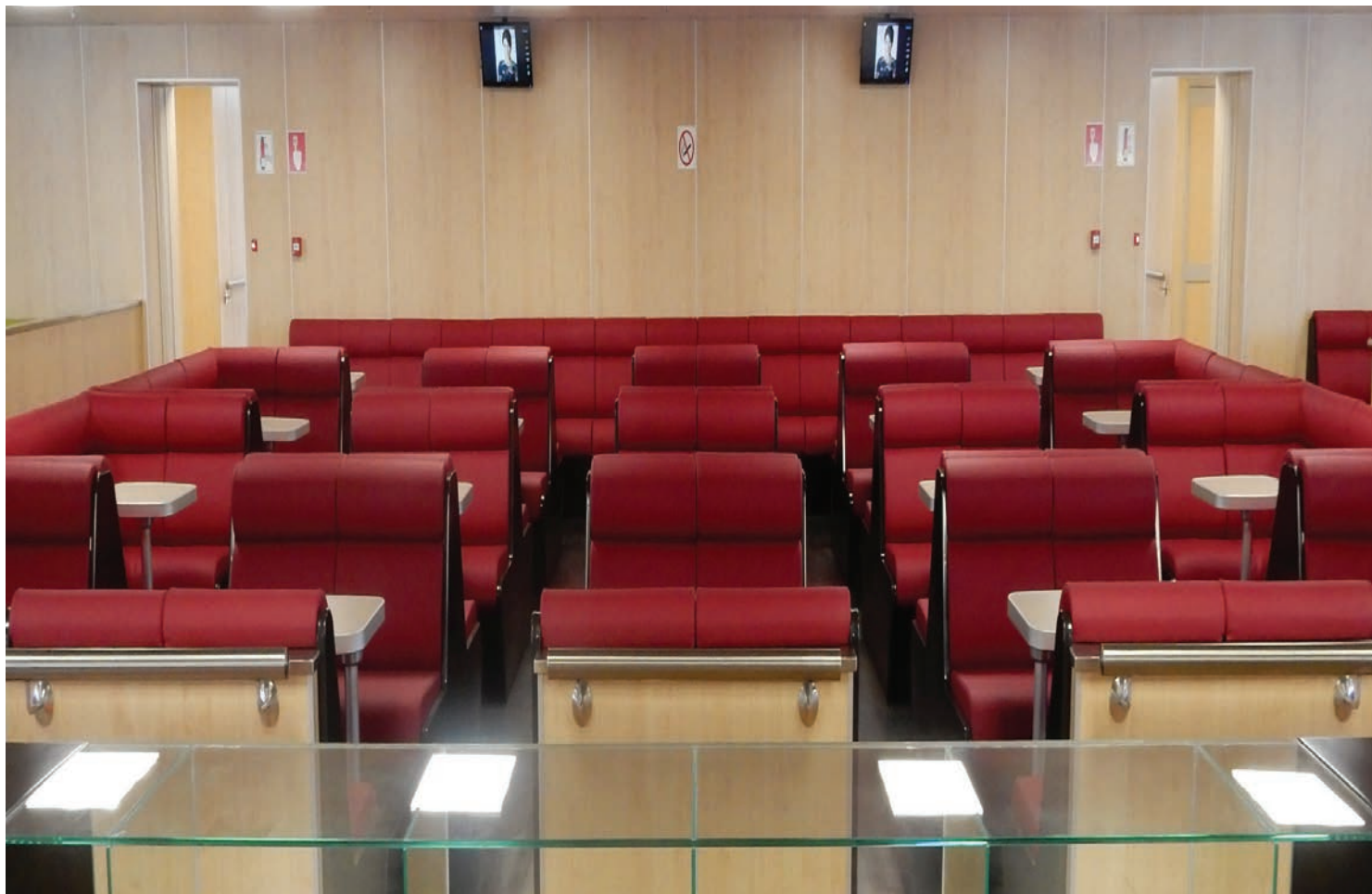
Cafe Style Seating Mid Lounge