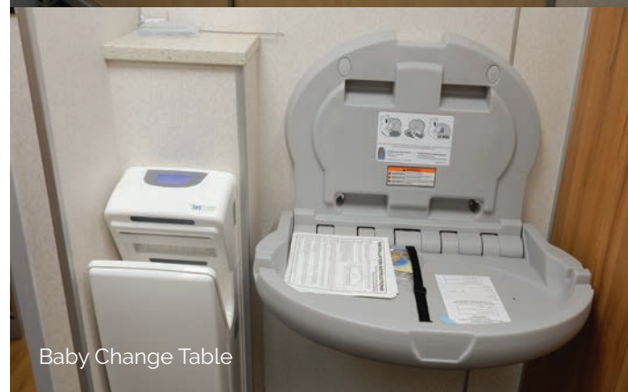
Baby Change Table