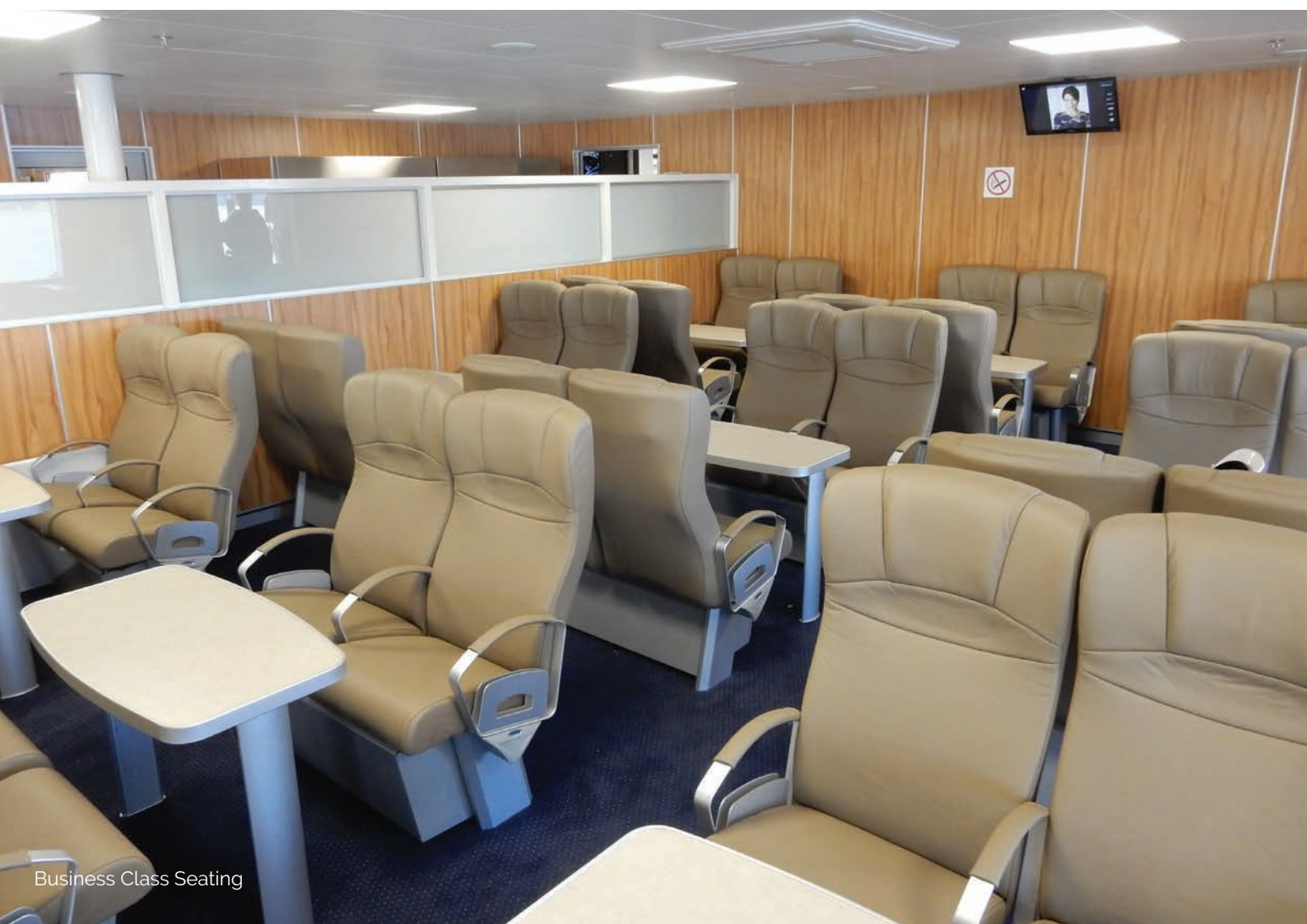
Business Class Seating