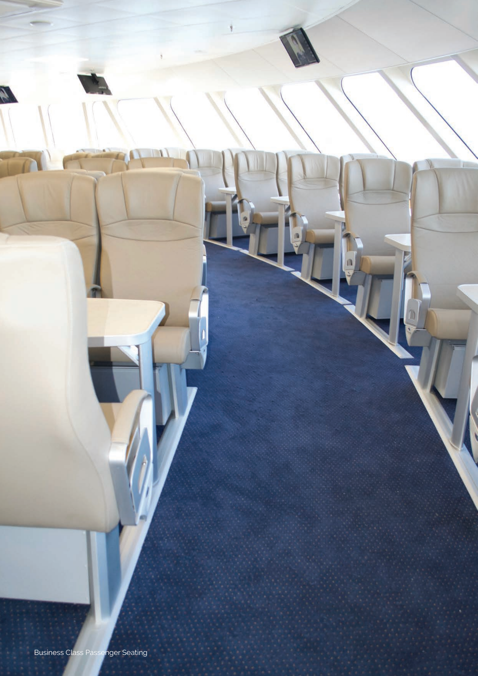
Business Class Passenger Seating