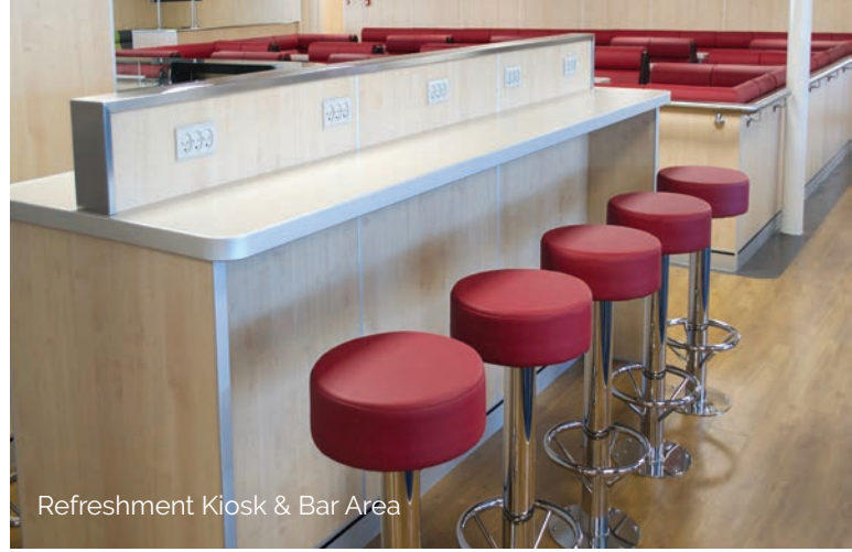
Refreshment Kiosk & Bar Area

Forward of these are the main seating areas in a regal navy trim with fore and aft seating and tables between. These seats have panoramic views to the exterior of the vessel as well as the galley area inboard. Fore and aft of these seats are the access stairs to the vehicle decks and the marine evacuation systems. All bulkheads are finished in crisp, clear tones, adding to a feeling of space and luxury.