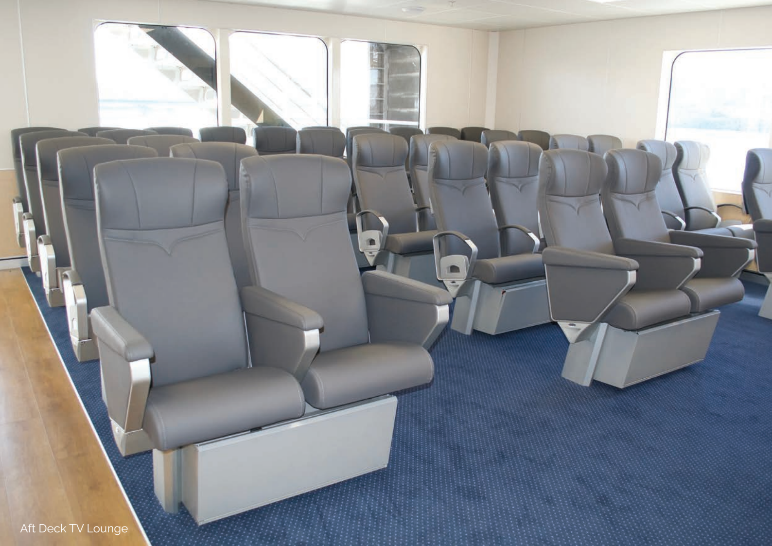
Aft Deck TV Lounge